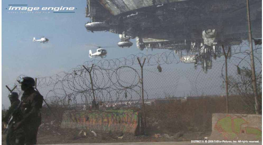
District 9.

More easily segment, reuse, and exchange data with or without file referencing. A new option to create assets with transforms (DAG assets) helps streamline the most common workflows with assets. Moreover, data can be exported and imported as offline files to flexibly partition scenes, while reference edits can be imported, exported, and removed without unloading.