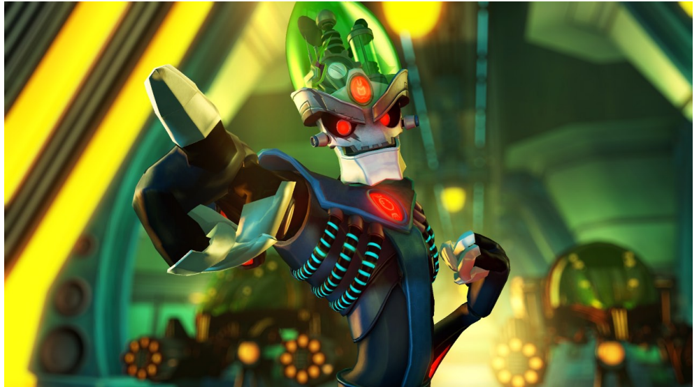
Ratchet and Clank Future: A Crack in Time , Sony Computer Entertainment/ Insomniac Games.