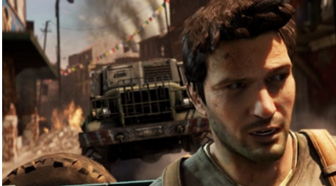
Uncharted 2: Among Thieves™. Image courtesy of Naughty Dog, Inc.