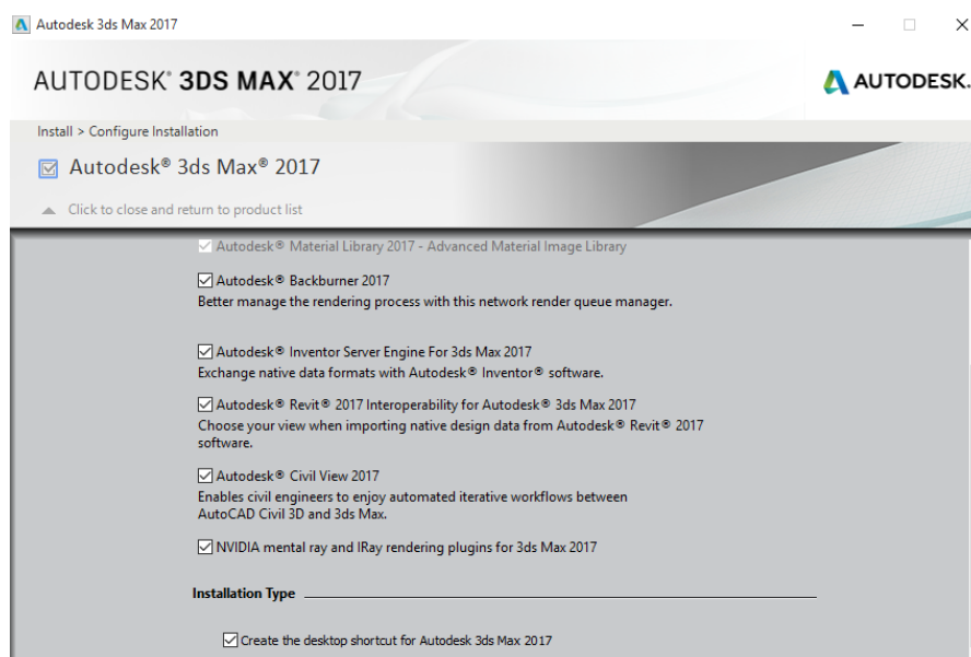
Figure 4: Configuration Options