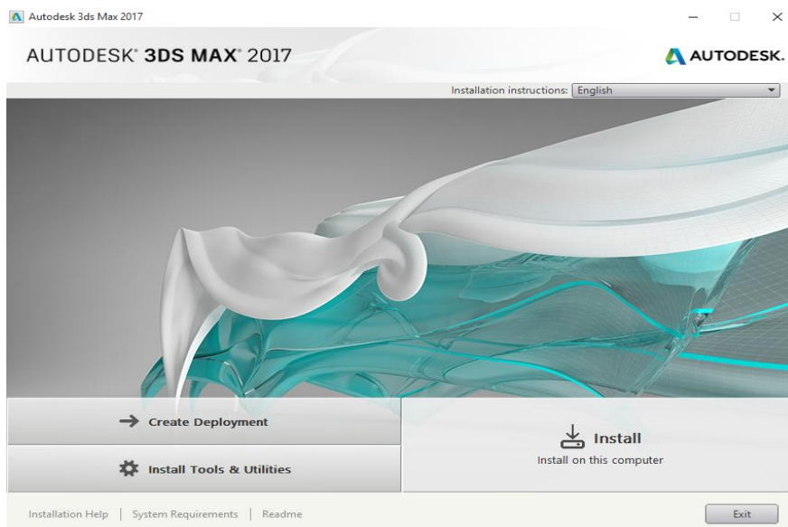
Figure 1: Initial Installation Screen