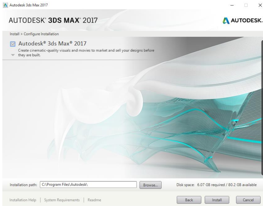
Figure 5: Configuration Complete