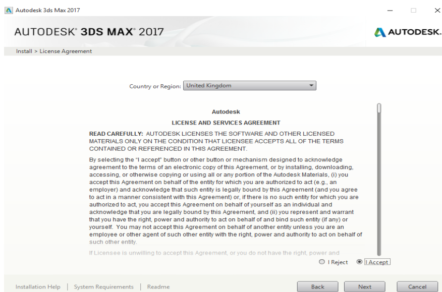
Figure 2: License Agreement